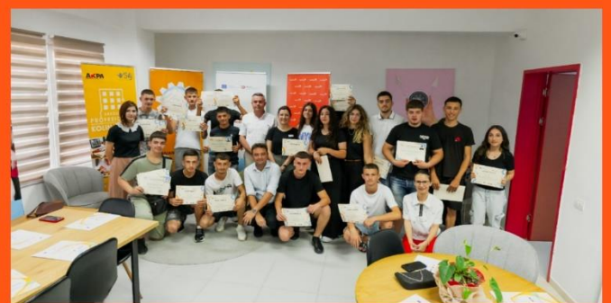
20 të rinj të certifikuar në kursin "Digital Skills" dhe "Soft Skills". 15 të rinj kanë ndjekur praktika profesionale

Through professional counselling and personalised career guidance, beneficiaries are discovering new development opportunities tailored to the real needs of the labour market. Thanks to the partnership with the National Agency for Employment and Skills and the support of the Regional Employment Directorate Lezhë, the project interventions in Lezhë have already delivered tangible results.